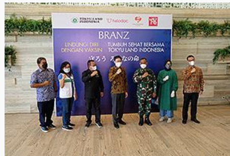
The opening ceremony

Tokyu Land Corporation has been operating in Indonesia since 1975, and through its local subsidiary PT. Tokyu Land Indonesia, we hold various programs related to the prevention and management of health problems of local residents. In FY2021, as a measure against COVID-19, we provided a total of 1000 vaccines twice in September and October. We will continue to contribute to Indonesia through these activities.