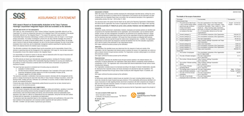
Third-party Verification Report.pdf (PDF:3,818KB)