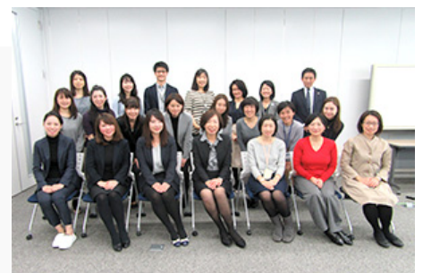
Positive networking college session

With an aim to promote women's participation, Tokyu Fudosan Holdings Group supports group-wide networking group where group employees, mostly women, meet up for "Positive Networking College" to discuss relevant issues. The program is open to everyone including male employees.