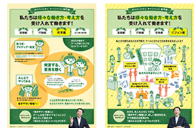
Diversity campaign poster