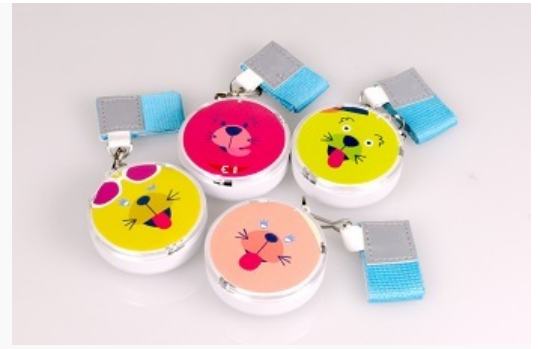
Q's Mall Original Personal Safety Alarms

TOKYU LAND SC MANAGEMENT CORPORATION, TOKYU LAND CORPORATION