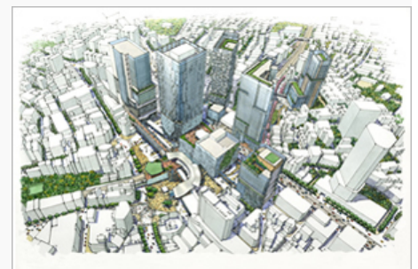
Conceptual image upon completion of the redevelopment project around Shibuya Station

One of Japan's largest terminal stations, Shibuya fulfills a role not only as a hub of transportation, but also a hub of community information and culture. Currently, a public-private partnership is taking place to make fundamental changes to Shibuya's urban functions and Tokyu Land Corporation is a participant in this redevelopment project. In 2027 when all redevelopment is completed and the area serves as a hub for creative contents industries and urban tourism, Shibuya will be transformed into a community that attracts even more people from Japan and abroad.