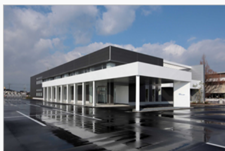
Yonago Operation Center (Yonago City, Tottori Prefecture)

Ewel, Inc. opened a second operation center that handles administrative processing in Yonago City, Tottori Prefecture to follow the other center in Matsue City, Shimane Prefecture. The Yonago Operation Center, which opened in February 2015, plans on hiring around 300 people from the local community over the next five years, which will contribute to the creation of local employment opportunities.