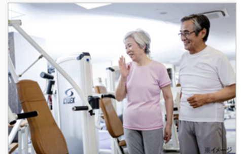
Rehabilitation (sample image)

In July 2015, Tokyu Sports Oasis, Inc. began accepting heart disease patients from Nippon Medical School Musashi Kosugi Hospital for heart rehabilitation. The company's heart rehabilitation program is carried out using preselected exercises based on a medical exam and ensures participant safety by having a physician on call to respond immediately in case of an emergency. In the future, Tokyu Sports Oasis, Inc. will work with Nippon Medical School Musashi Kosugi Hospital to create an urban area heart rehabilitation program jointly run by both.