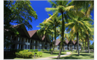
Palau Pacific Resort

For nearly three decades Tokyu Land Corporation through its management of the Palau Pacific Resort has continually worked on environmental conservation, the passing down of cultural traditions, the creation of employment opportunities and development of infrastructure in Palau. More than 80% of the Palau Pacific Resort's staff is hired from Palau and Tokyu Land Corporation gives back to the local community through the creation of employment opportunities and developing human resources qualified for working in the hospitality industry.