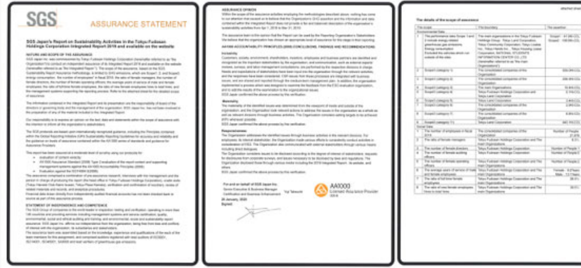
Third-party Verification Report.pdf (PDF:8,631KB)