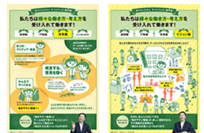
Diversity campaign poster