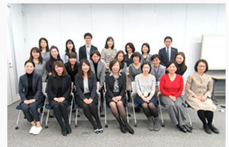
Positive networking college session

With an aim to promote women's participation, Tokyu Fudosan Holdings Group supports group-wide networking group where group employees, mostly women, meet up for "Positive Networking College" to discuss relevant issues. The program is open to everyone including male employees.