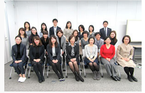
Positive networking college session

With an aim to promote women's participation, Tokyu Fudosan holdings Group supports group-wide networking group where group employees, mostly women, meet up for "Positive Networking College" to discuss relevant issues. The program is open to everyone including male employees.