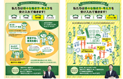
Diversity campaign poster