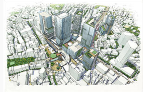
Conceptual image upon completion of the redevelopment project around Shibuya Station

One of Japan's largest terminal stations, Shibuya fulfills a role not only as a hub of transportation, but also a hub of community information and culture. Currently, a public-private partnership is taking place to make fundamental changes to Shibuya's urban functions and Tokyu Land Corporation is a participant in this redevelopment project. In 2027 when all redevelopment is completed and the area serves as a hub for creative contents industries and urban tourism, Shibuya will be transformed into a community that attracts even more people from Japan and abroad.