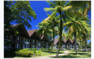
Palau Pacific Resort

For nearly three decades Tokyu Land Corporation through its management of the Palau Pacific Resort has continually worked on environmental conservation, the passing down of cultural traditions, the creation of employment opportunities and development of infrastructure in Palau. More than 80% of the Palau Pacific Resort's staff is hired from Palau and Tokyu Land Corporation gives back to the local community through the creation of employment opportunities and developing human resources qualified for working in the hospitality industry.