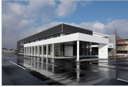
Yonago Operation Center (Yonago City, Tottori Prefecture)