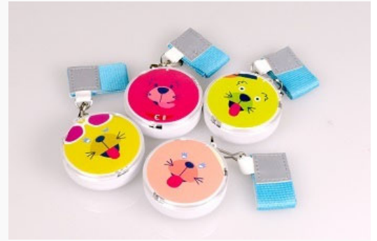
Q's Mall Original Personal Safety Alarms

The Smile Project has also implemented a number of community revitalization programs including donation of gym equipment to elementary schools around the Mall, responding to a local request for the better environment for local children to enjoy sports.