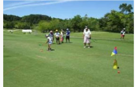
Golf lesson in progress

Tokyu Resort Service Co., Ltd, TOKYU LAND CORPORATION