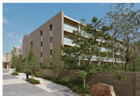
Grancreer Setagaya Nakamachi (senior housing)