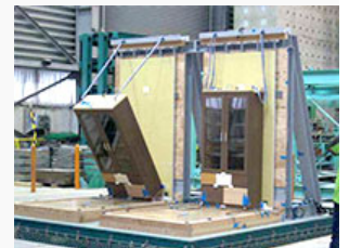
Testing in a vibration simulator Cooperation: Tokyu Construction Co., Ltd. Engineering Research Laboratory

To prevent furniture from falling over during an earthquake, we conduct testing in a vibration simulator to ensure that walls that will have furniture fixed to them using metal fixings have sufficient rigidity and strength and we utilize a specially reinforced specification for the metal fixings.