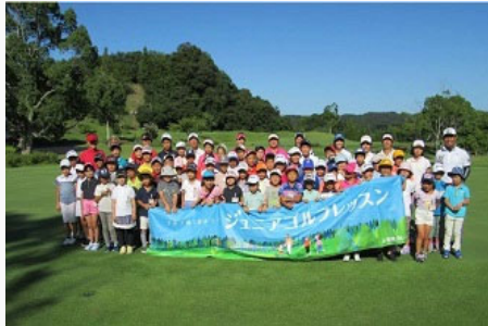
Otakijo Golf Club

Tokyu Land Corporation and Tokyu Resort Service Co., Ltd. have been arranging golf lessons for elementary school students during summer break to help children get fit and learn new skills and good manners. The lessons, led by golf pros, were held at the Otakijo Golf Club in Chiba Prefecture in August 2018. Approximately 60 elementary school students took part in this enjoyable experience learning to play golf.