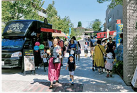
Setagaya Nakamachi Festival (scene on a festival day)