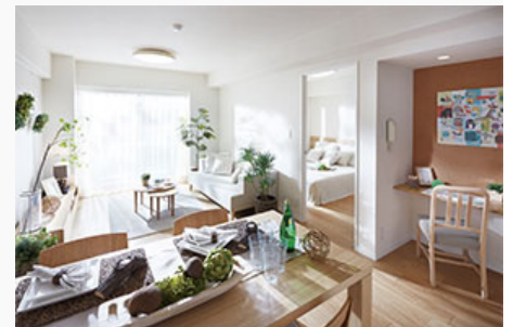
Model unit for L'gente Liber Shiki

In September 2015, Tokyu Livable, Inc. opened the doors to the model unit for L'gente Liber Shiki, the first in a series of renovated condominiums with the concept of "creating happiness for families raising children." This building features a unique "child raising support master plan" in which layouts provide a comfortable living environment for families raising children and considers the future of the children living there. So that both children and families alike can live in comfort and peace of mind, condominiums that adopt this master plan are thoroughly checked by accredited experts in all aspects, from individual units, common areas and management system to property location and surrounding environment, receiving accreditation as a "child-friendly housing and environment" from Mikihouse Child & Family Research and Marketing Institute Inc.