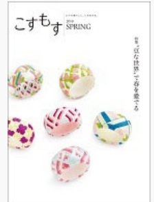
the Group newsletter Cosmos

Reflecting the Group's desire to continue to enrich customers' lives even after they have purchased our products or used one of our services, we run the Tokyu Cosmos Club, which is an exclusive member's only organization. We are broadening communication with the more than 100,000 members of the Tokyu Cosmos Club through the Group newsletter Cosmos and the member's only website called Cosmos WEB. In particular, in the customer satisfaction survey carried out in 2018, 86.3% of the members gave us opinions that they are "satisfied". We will continue to strive to deepen communication with our customers.