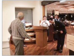
Training in progress