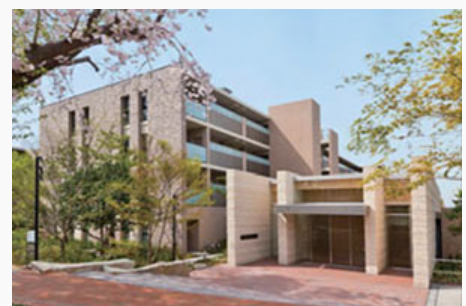
BRANZ City Setagaya Nakamachi (condominiums for sale)