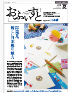
the free newspaper Office To

With the aim of helping the office workers working in buildings managed by the company to enjoy a more fulfilling office lifestyle, Tokyu Land Corporation publishes the free newspaper Office To , and also operates the Office To CLUB website in collaboration with EWEL Inc. to inform tenants about special services offered by the Tokyu Fudosan Holdings Group that they can access. Both Office To and Office To CLUB have proved very popular with readers and site-users.