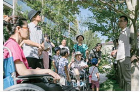
Setagaya Nakamachi Festival (exploring the town)

TOKYU LAND CORPORATION, TOKYU E-LIFE DESIGN Inc.