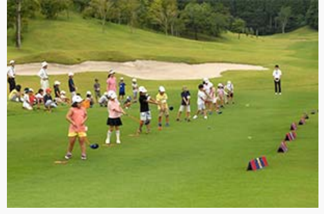
Golf lesson in progress

Tokyu Resort Service Co., Ltd, TOKYU LAND CORPORATION